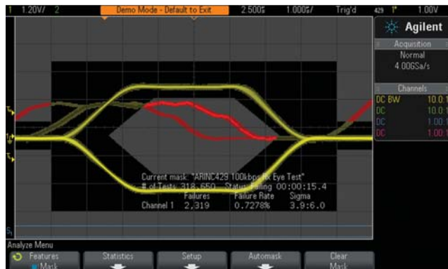
Figure 2: Testing the signal integrity of a differential ARINC 429 serial bus using eye-diagram mask testing.

Figure 2 shows an ARINC eye-diagram mask test performed at the input of a remote receiver. The scope repetitively captures and overlays all 32 bi-level RZ bits of every word. In this example, we can see some bits failing the mask test due to bit timing shift and reduced amplitude. This is an indication that we probably have a signal integrity problem in our system.